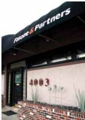
▲ Fasone & Partners, Inc., is located in the historic Westport district at 4003 Pennsylvania Ave., Kansas City, Mo.

“Donnelly was the first place my mind was really challenged. It was the first time my ‘think-power’ had ever really been channeled...”