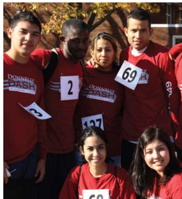
Top: Participants begin their 5K excursion through the neighborhoods surrounding the College. Above: Donnelly students gather following the 5K to listen to music and enjoy a hot breakfast.

Send the vendor name and contact information to Laura Bryon at lbryon@donnelly.edu . Your suggestions are much appreciated!