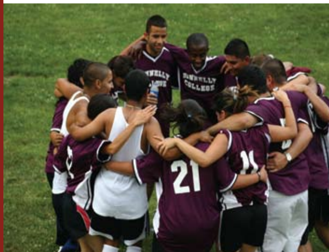
Members of the men's and women's soccer teams huddle up before the men's championship game.