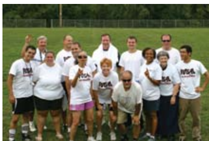
Faculty team members pose after battling the men's and women's soccer teams. Top: Student models appropriate attire for a job interview.