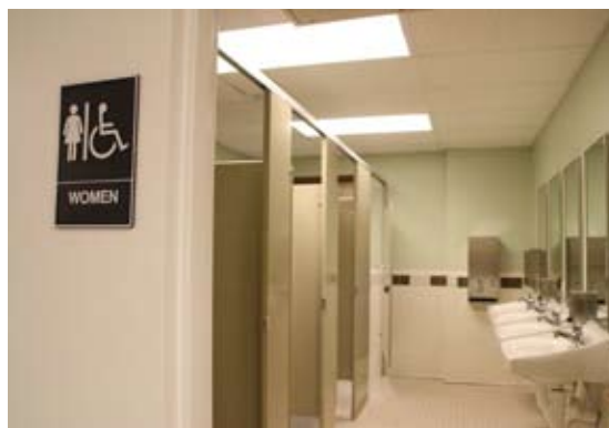
Left: New carpet, white boards, and paint gives classrooms a more modern look. Top Right: Desks, chairs, and white boards fill the new lecture hall on the first floor. Bottom Right: Restrooms on first and second floors shine after the renovation.